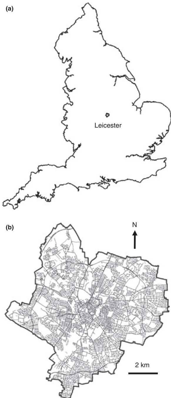
Fig. 1. (a) The location of Leicester within England: the study area (shaded grey) comprised of all land within the Leicester unitary authority boundary (grey line); (b) the street network within the study area.

addition, it broadly accounts for heterogeneity in vegetation structure across an urban area without creating too many different classes, thereby making it easier to apply the same methodological approach in other cities.