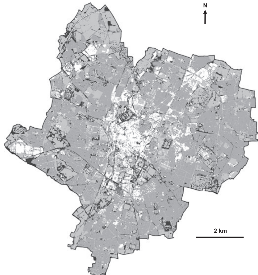
Fig. 2. The distribution of above-ground vegetation carbon across Leicester, according to the landcover–land ownership category of individual vegetation patches (Table 1): graduated shading from 0.00 \text{ kg C m}^{-2} (white) to 28.86 \text{ kg C m}^{-2} (dark grey).

An estimated 231 521 tonnes (95% CI = 195 914–267 130) of carbon is stored within the above-ground vegetation across the city (Table 1; Fig. 2), equating to a mean figure of 3.16 \text{ kg C m}^{-2} of urban area (95% CI = 2.65–3.62). Of this total, 97.3% (225 217 tonnes; 95% CI = 189 613–260 821) consists of carbon stored in trees. A further 1744 tonnes (0.7%) is contained within woody vegetation, with the remaining 2% (4561 tonnes; 95% CI = 3706–5417) attributed to herbaceous vegetation. The mean percentage carbon content of herbaceous vegetation was 42.02% (95% CI = 41.34–42.69), corresponding