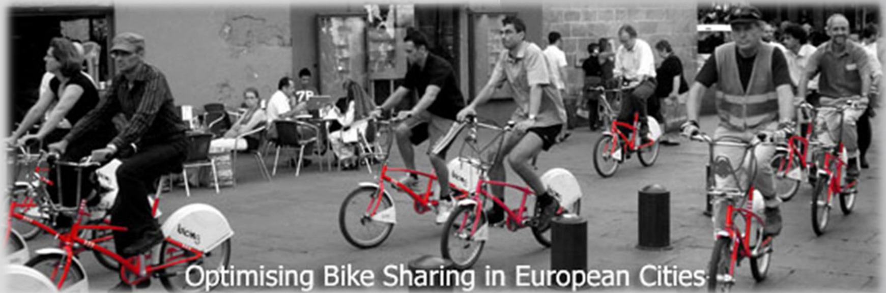
Optimising Bike Sharing in European Cities